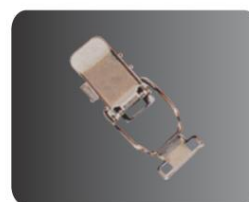
Stainless steel latch 不銹鋼搭扣 MODEL:LC-02